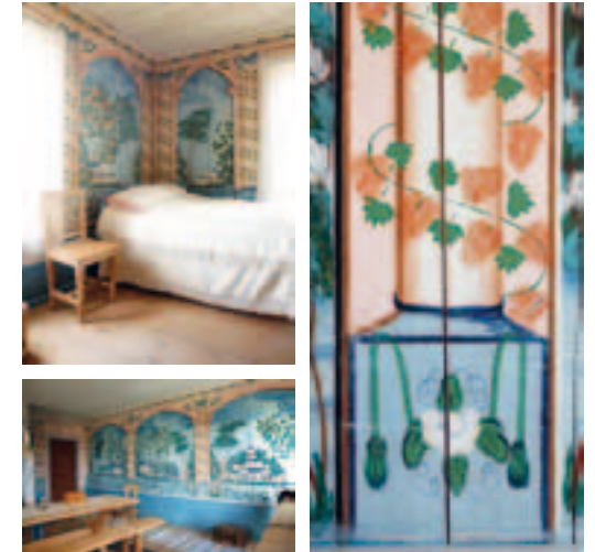
Typical Dalarna paintings at Jon-Lars and the other farms in the village.

next to older timber houses painted red. The buildings were embellished with glazed verandas and ornamental woodwork. Architectural history professor Fredric Bedoire writes that there are few places where you find woodwork that is as richly decorative as that in Alfta. Some big farms – Jon-Lars and Ol-Svens in Långhed are two examples – were never covered in wooden panelling and kept their plain red-painted timber.