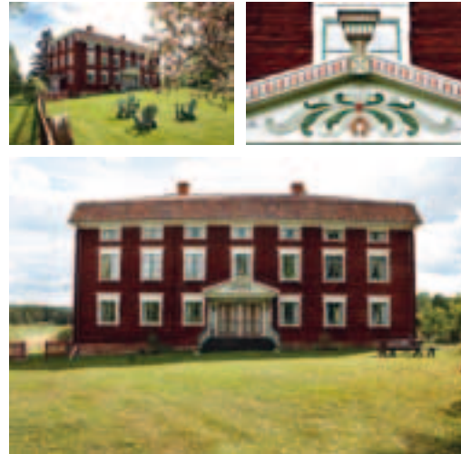
The huge Jon-Lars farmhouse with its magnificent porch.