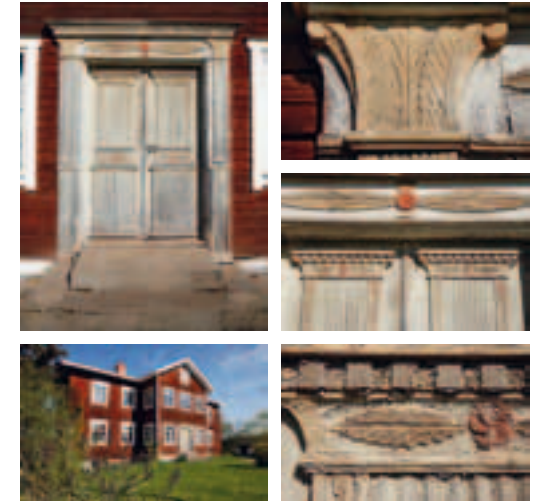
The Alfta rose and picked leaves are found on farmhouse doors and porches.

foremost symbol of the parish. It is still used as decoration in woodwork, jewellery and other items.