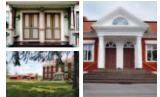
The school's entrance was the inspiration for the porch of the big farm Jon-Lars in Långhed.