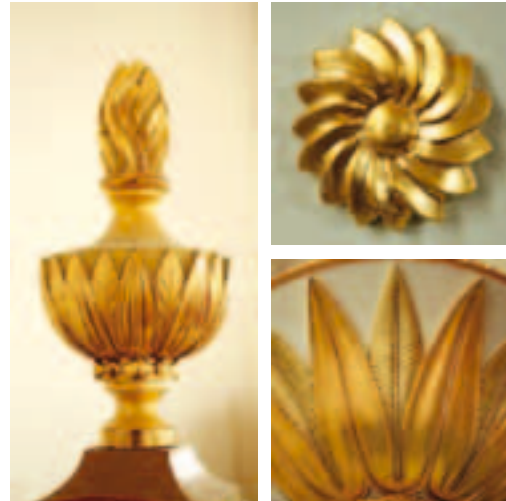
Carved roses and leaves, by carpenters Brunk and Tulpan.